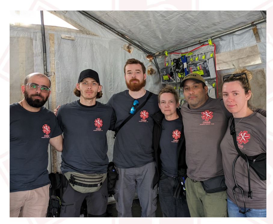
CADUS Nothilfe-Team in Gaza, März 2024.

The team's self-sufficiency is also ensured with its own food supply, water filtration, and power generation.