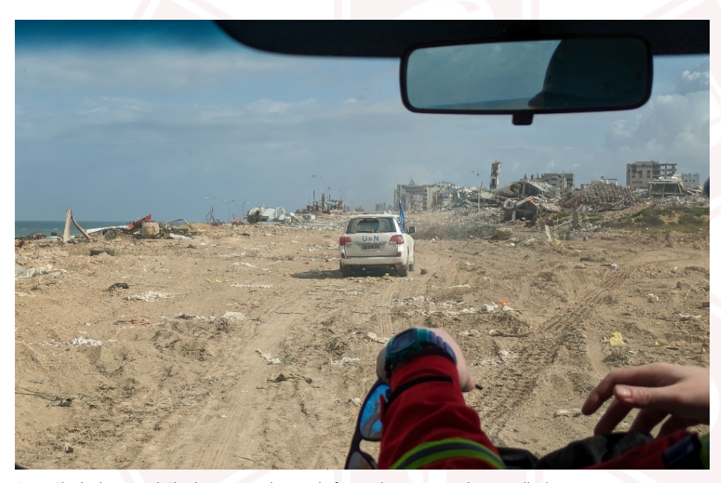
Gaza City is destroyed. The journey to the north, from where we conduct medical evacuations, requires considerable skill from our drivers. March 2024.

Financially, this mission also poses a significant challenge: we initially relied only on our funds and donations. Despite institutional support, we can only work comprehensively with the help of donations.