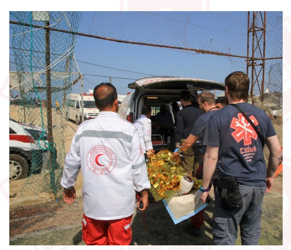
Joint work at the TSP with the Palestinian Red Crescent, March 2024.