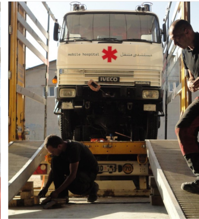
Mobile Hospital, Erbil, Iraq, 2017