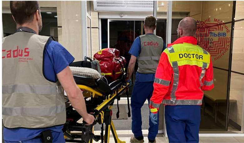
CADUS patient transport (MedEvac) deployment in Lviv, Ukraine, 2022

Our aim is to provide rapid and direct support in acute crises in order to save lives and alleviate suffering. We bridge gaps in supply until local structures can take over (again).