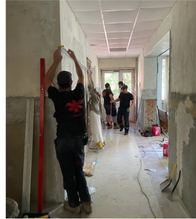
Mobile workshop, Motyzhyn school, Ukraine, 2022,

The activities of the association, which can be read about in our annual reports , are based on full-time staff and volunteers alike. A broad network of different trades, combining creativity and critical thinking, has made CADUS what it is today: an exceptional humanitarian emergency aid organization. In the Makerspace, CADUS develops innovative solutions and concepts while carrying out humanitarian missions in highly complex crises.