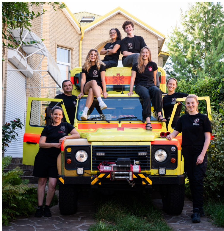
CADUS team at deployment in Dnipro, Ukraine, 2023

If you have any further questions about donations and their processing, please feel free to contact us at any time: spenden@cadus.org .