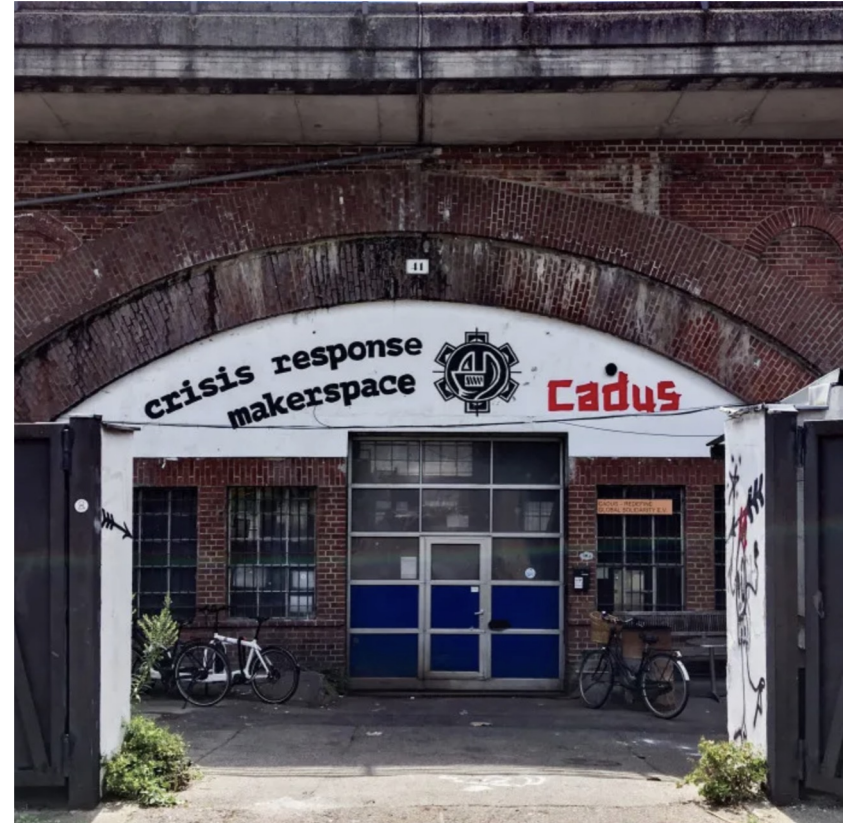
CADUS Crisis Response Makerspace, Berlin, Holzmarktstraße

The CADUS Crisis Response Makerspace networks with other makerspaces in our countries of operation and worldwide to enable cooperation across borders.