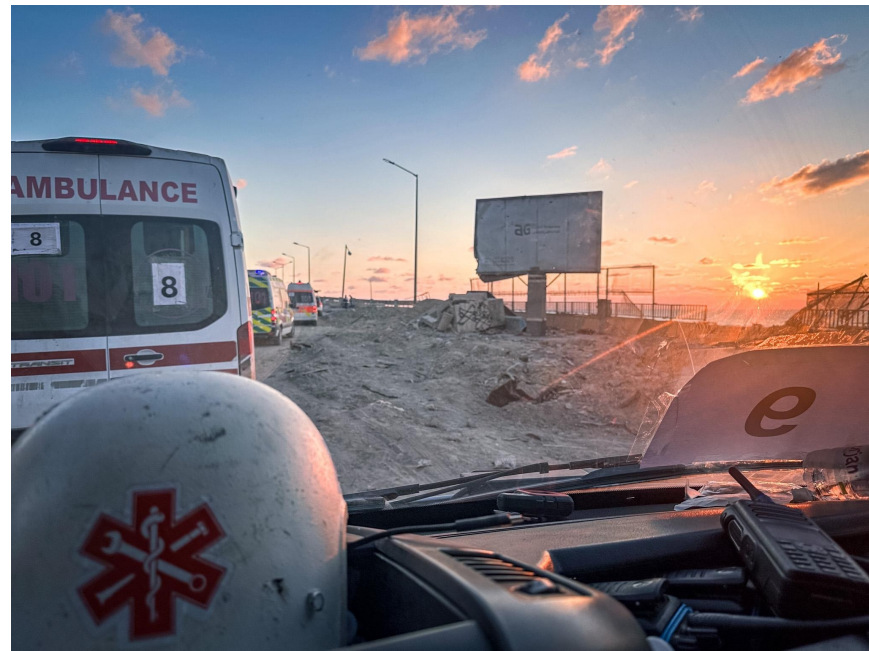
CADUS as part of a medical convoy, North Gaza, October 2024

That is why we work together with local partners to find creative, needs-oriented solutions. We share our knowledge through training and are committed to providing sustainable, respectful humanitarian aid.