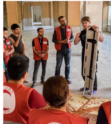
Rescue workshop, Nordost-Syrien, 2015