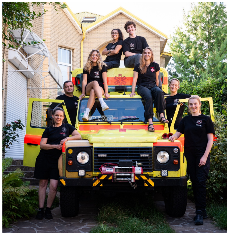
CADUS team at deployment in Dnipro, Ukraine, 2023

If you have any further questions about donations and their processing, please feel free to contact us at any time: spenden@cadus.org .